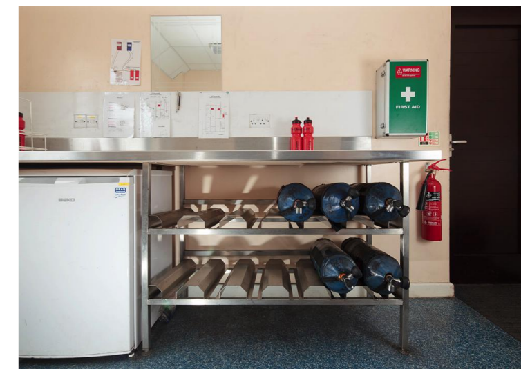
Fig. 1 Typical Cylinder Rack